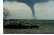
Tornado in Oil Trough

The National Mutual Aid & Resource Management Initiative supports the National Incident Management System (NIMS) by establishing a comprehensive, integrated national mutual aid and resource management system that provides the basis to type, order, and track all (Federal, State, and local) response assets. The initial typing of 60 response resources has been completed. They have been broken out into eight disciplines, which are Fire/HazMat, Law Enforcement, EMS, Emergency Management, Health & Medical, Public Works, and Search & Rescue. Within the disciplines, there are divisions by category, kind, and type. A resource glossary is available on the NIC website (see last page).