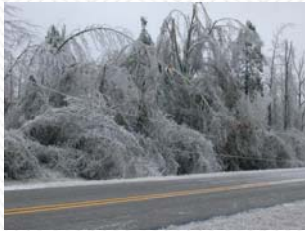
Ice storm damage in Jefferson County, 2000